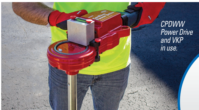
CPDWW Power Drive and VKP in use.