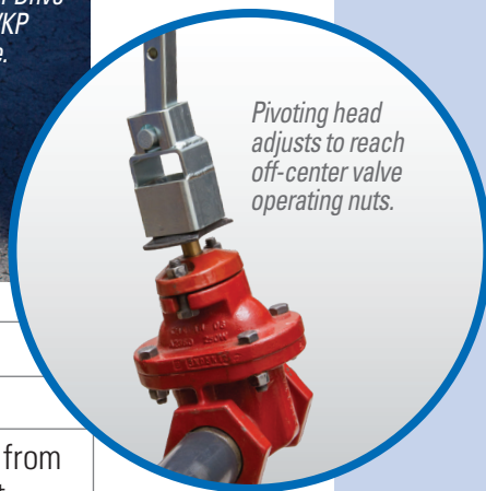
Pivoting head adjusts to reach off-center valve operating nuts.