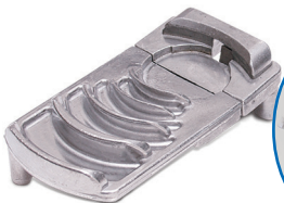
DEB4 Deburring Tool