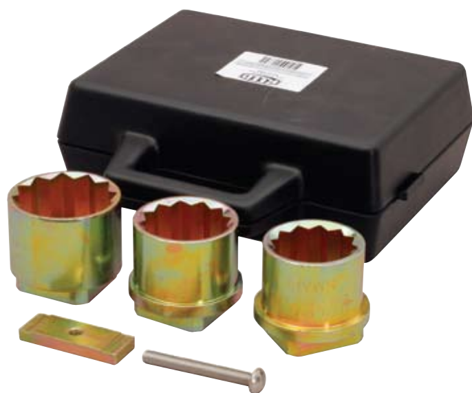
Valve Key Socket Set include: Valve key sockets in 3 sizes (small, medium, large), 3" screw & attachment plate in a durable carrying case.

Reed's selection of Valve Keys is the most complete and compact around for turning gate valves in the street and curb stop valves to buildings. Visit www.reedmfgo.com to see the full line of Valve & Curb Keys.