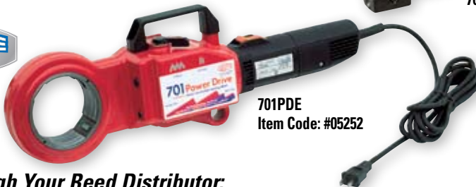
701PDE Item Code: #05252