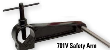
701V Safety Arm